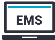
Election Management System